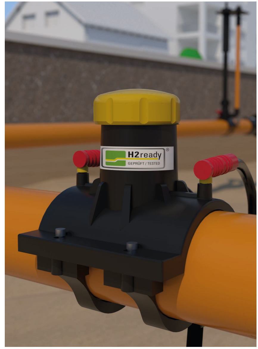
Balloon shut-off saddles - access point for commercial shut-off equipment

When repairing and integrating gas pipelines, a temporary interruption of the gas supply is usually necessary. With the FRIALEN balloon shutoff saddle SPA and the FRIALEN purge stack GAB, a safe shut-off is guaranteed.