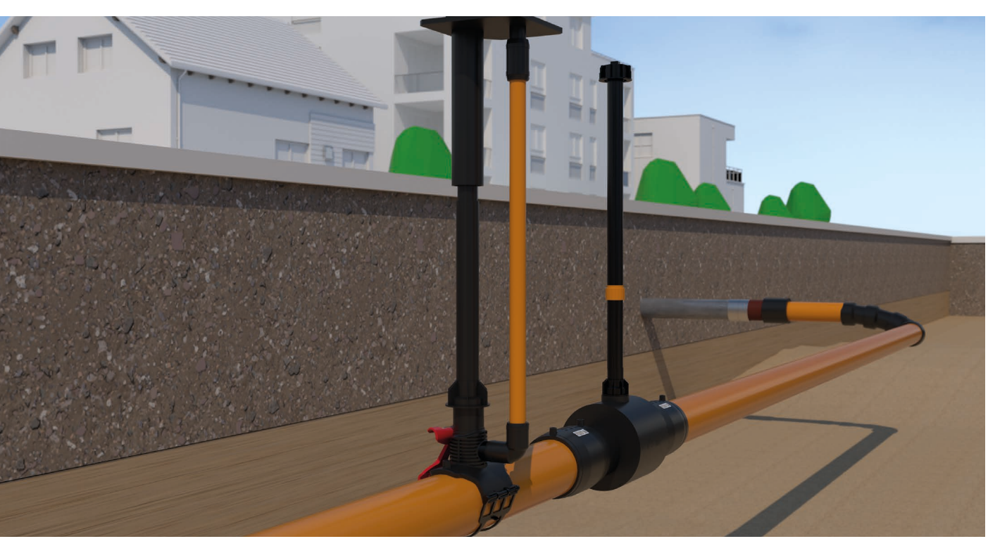
The combination of ball valve and purge stack GAB

As a pre-assembled, compact unit, the GAB minimises costs on the construction site and also serves as a measuring point fitting to verify the odorant content.