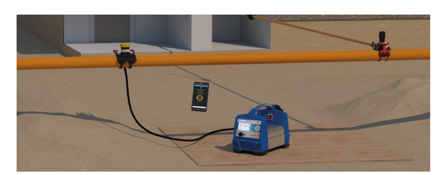
FRIAMAT 7 universal fusion unit with App