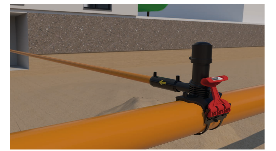
DAA RED SNAP – Your solution for house connections